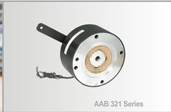
AAB 321 Series